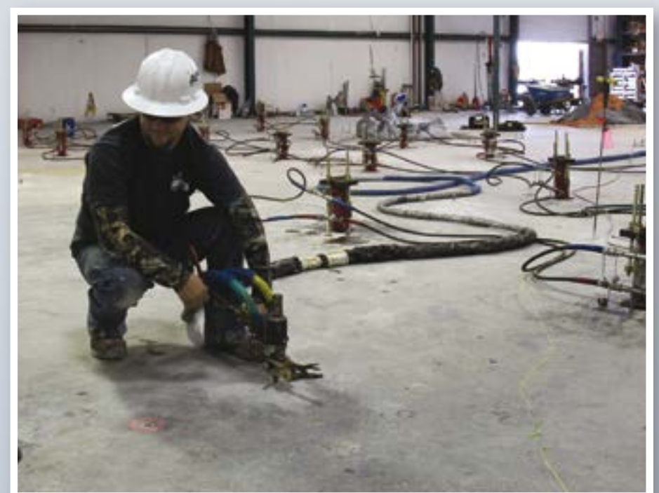
Void filling with PolyLEVEL®