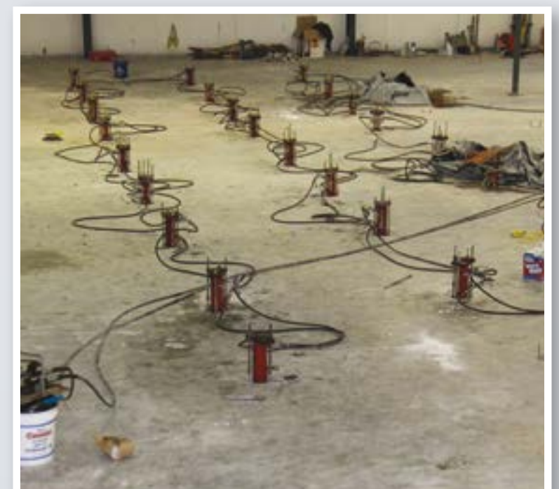
Lift cylinders fitted to installed slab piers