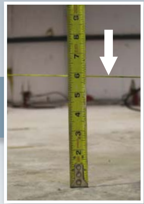
String line indicating nearly six inches of settlement

A system of hydraulically-driven push piers was selected to permanently stabilize and lift the settled slab. Slab pier locations were laid out in grid patterns with a maximum spacing generally less than eight feet. Eight-inch-diameter core holes were made through the floor to allow for bracket installation. One hundred twenty-two (122) Model 288 (2.875-inch OD by 0.165-inch wall) slab piers were installed to an average depth of 30 feet and an average drive pressure of 3,200 psi (drive force of 30 kips). The slab piers were connected in series with hydraulic cylinders to uniformly raise the floor back toward level. PolyLEVEL® polyurethane foam was then injected under the slab to fill voids. Once injected, the two liquid urethane components react to form a rapidly setting rigid foam with a compressive strength generally greater than 100 psi. Approximately 5,100 pounds of PL400 were injected below the slab.